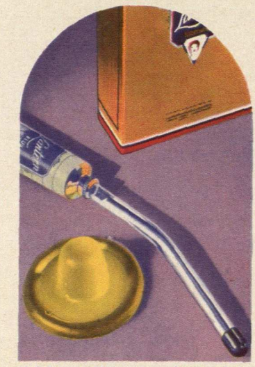
U. S. Patent 1,995,818 and many foreign patents

LANTEEN (Brown) CAP DIAPHRAGM is the latest improved design for diaphragms. One size fits all normal women. Used in combination with LANTEEN (Blue) JELLY, it offers a complete and positive protection to the wife whose health requires this safeguard.